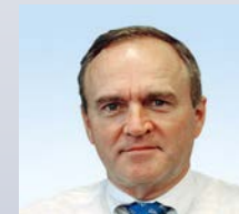
Capt. Larry ROCKLIFF Chief Test Pilot Production Flight Test in China